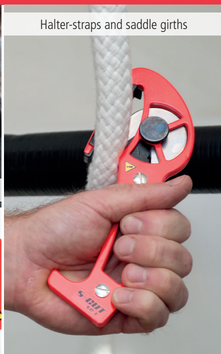
Halter-straps and saddle girths