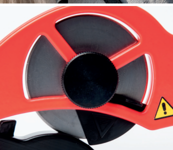
Rotatable cutting blade with adjustable guard