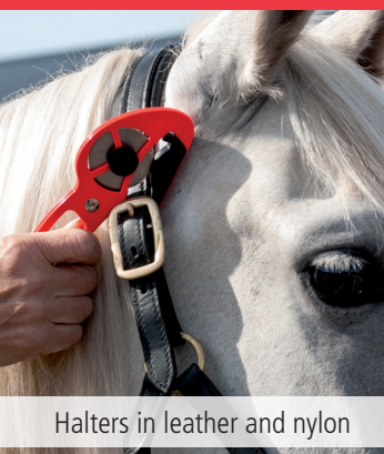
Halters in leather and nylon

Cuts leather, rope and fence wire in one simple operation without "sawing"