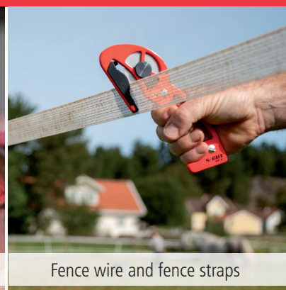
Fence wire and fence straps