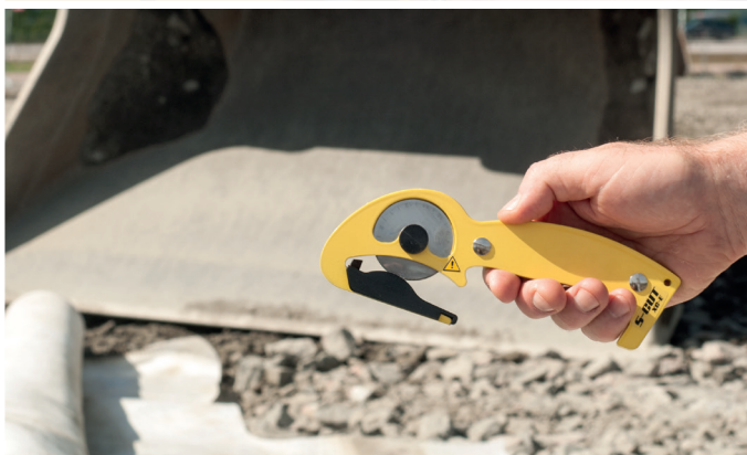
In construction sites for ground cloth.