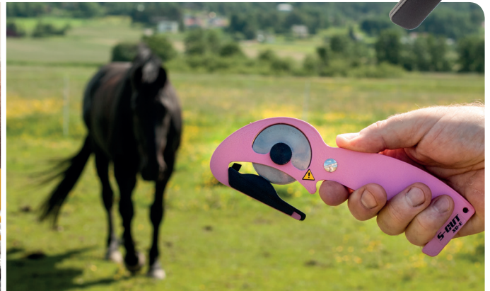
In the stable and transport if your horse get stuck.