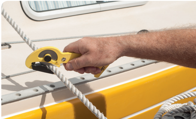
On the boat for emergency situations, cuts a tarp in a second.